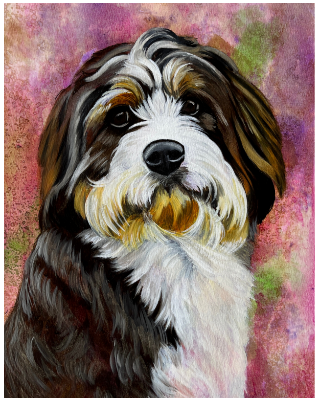
Nala - 13x9in - oil - 2024