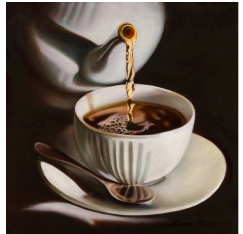
Tea Time - 10x10in - oil - 2023

Fascinated by the scientific aspects of the mischtechnik and my spiritual experiences of painting, I seek to capture not only the physical appearance of my subject but also its emotive qualities. The magical interplay of light and color invites the viewer into the canvas, offering them a space to reflect upon and interpret my imaginative dreamscapes.