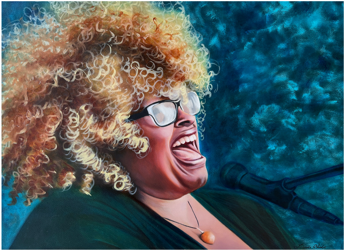
Soul Candi - 20x27in - oil - 2024