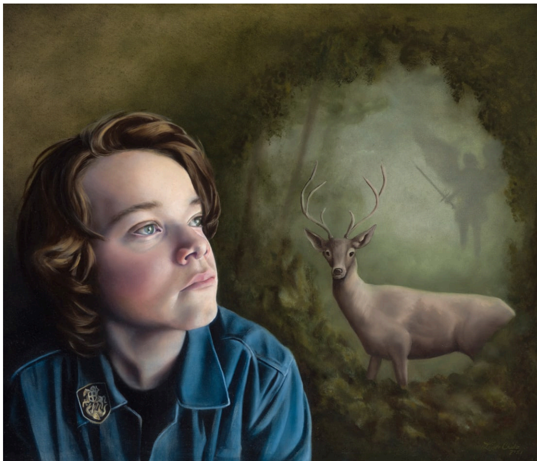
Brave and True - 24x30in - oil - 2021