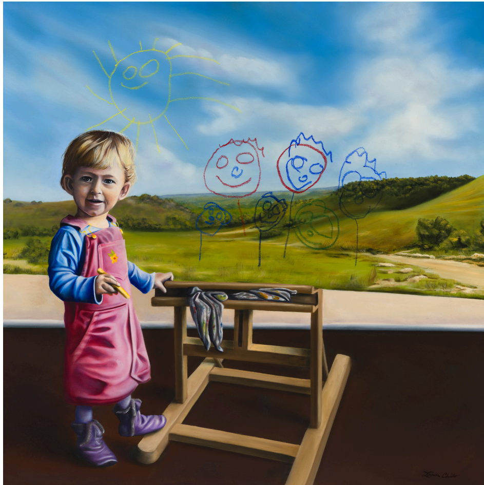
Helping Mommy - 36x35in - oil - 2023