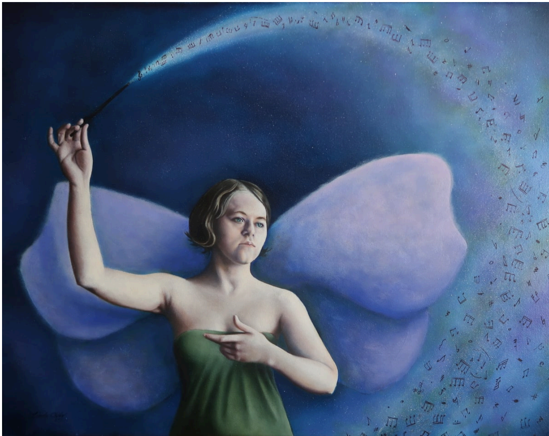
Morpho Musica - 22x28in - oil - 2022