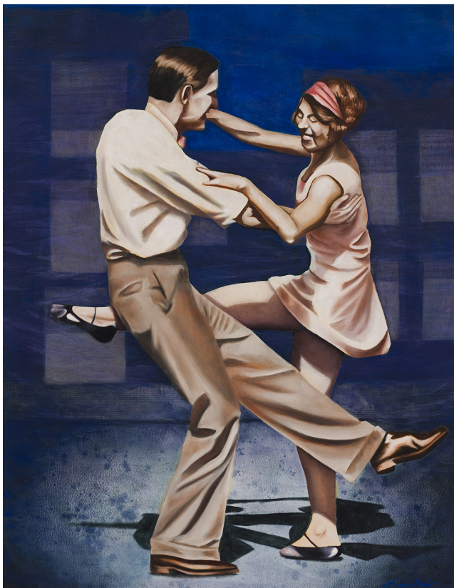
Up On The Roof - 29x22in - oil - 2024