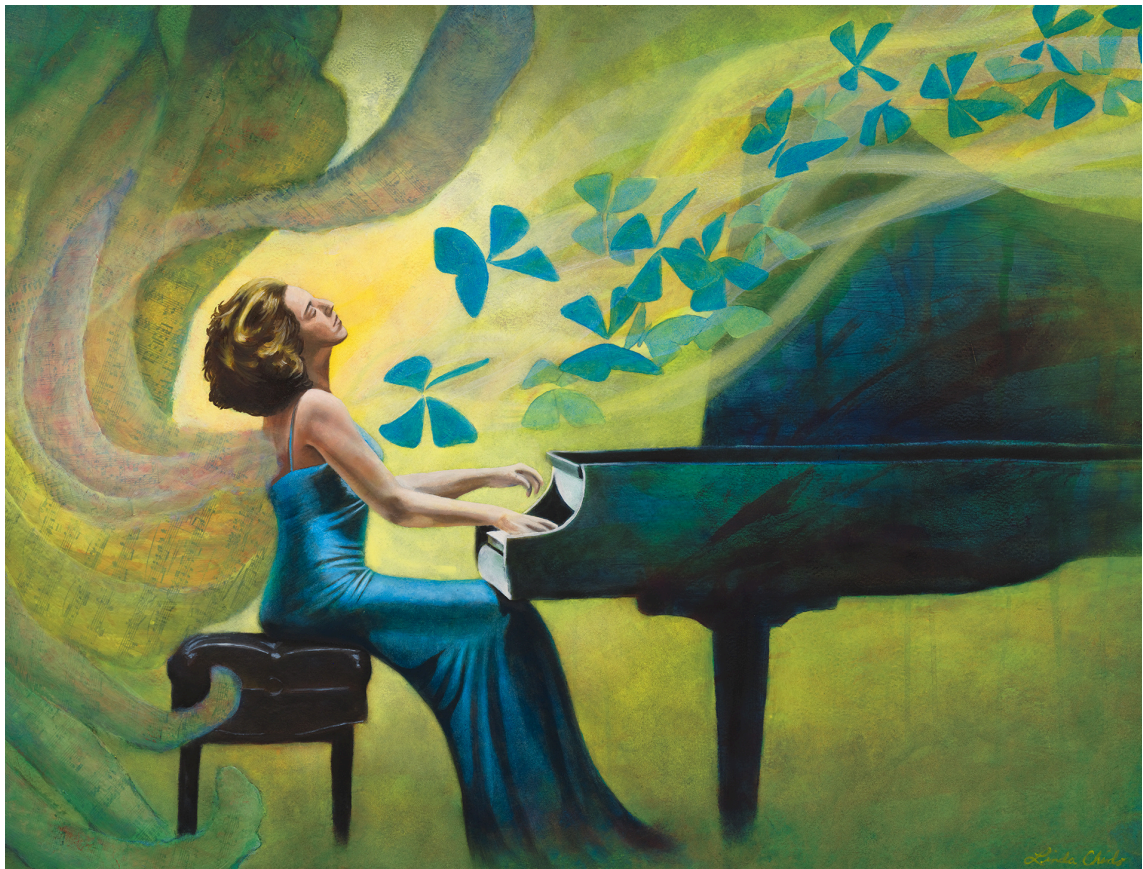
Papilion - 20x27in - oil - 2024