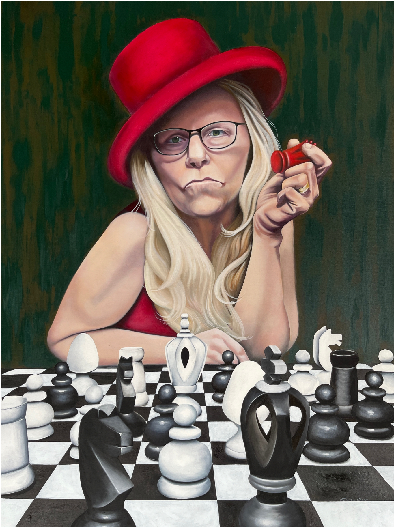
Check - 48x36in - oil - 2024