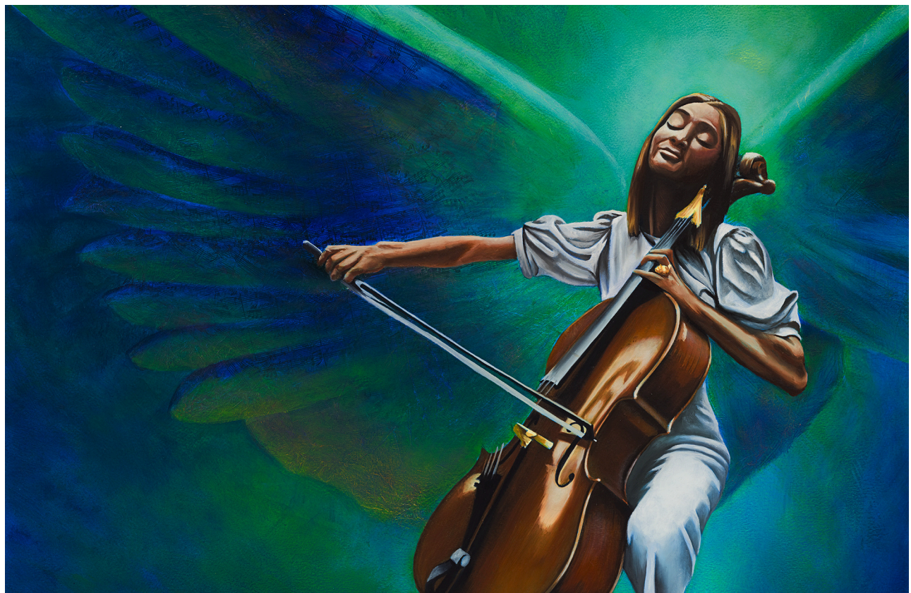
Talking To An Angel - 21x28in - oil - 2024