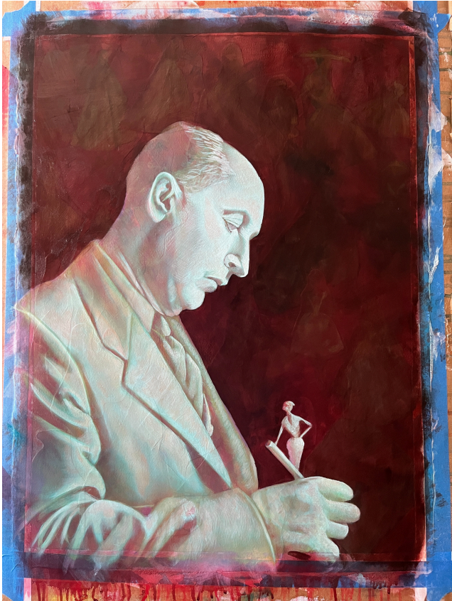
Homage Dior - 28x21in - oil