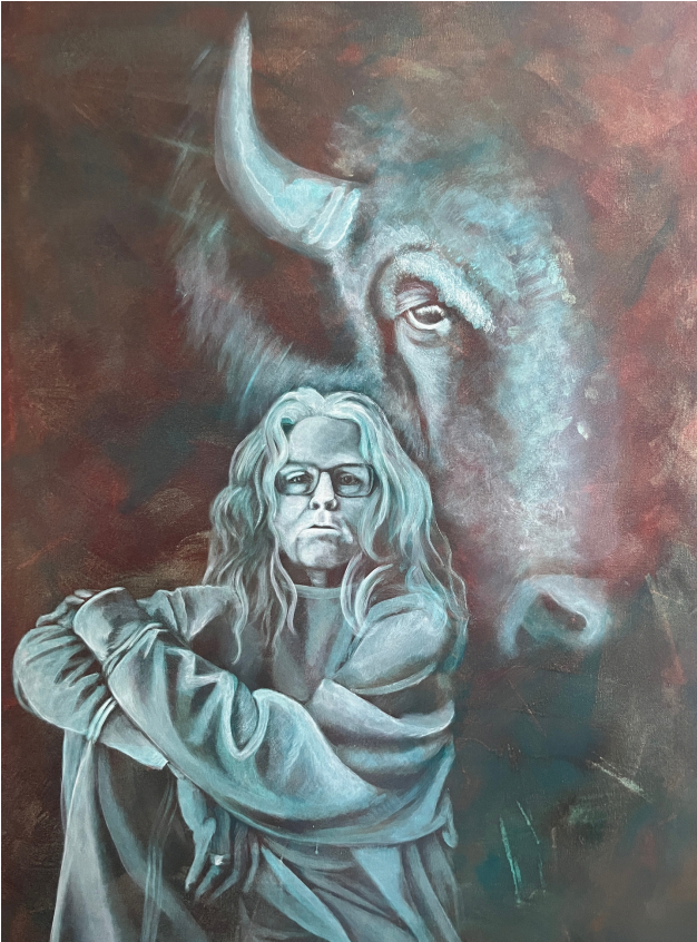
Hometown Gal - 48x36in - oil